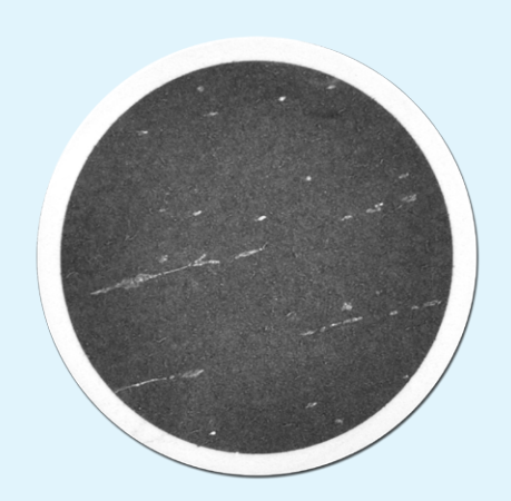
No Retrofit System Uncontrolled Diesel Exhaust