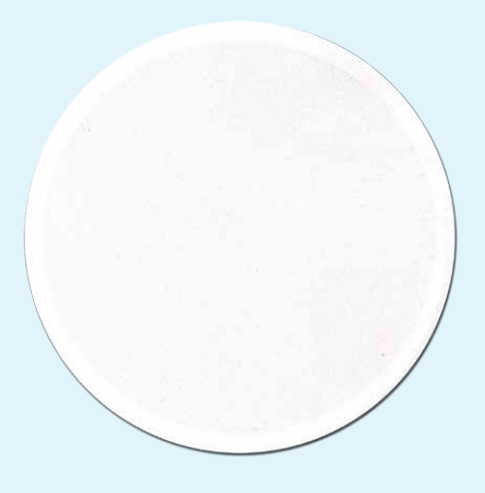
Retrofitted with Diesel Particulate Filter (DPF) (Level 3)

Little black carbon removal Little utrafine PM removal Does not remove lube oil ash